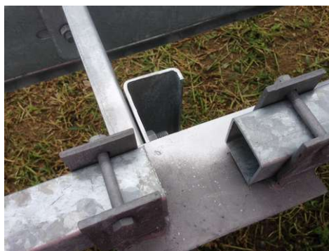
Connecting bracket: Examples for C-post, Sigma post and concrete