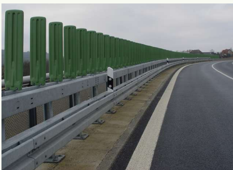
Example of an installation on SR Eco