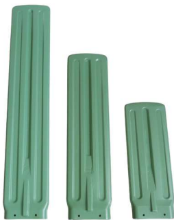
1200 mm 900 mm 600 mm