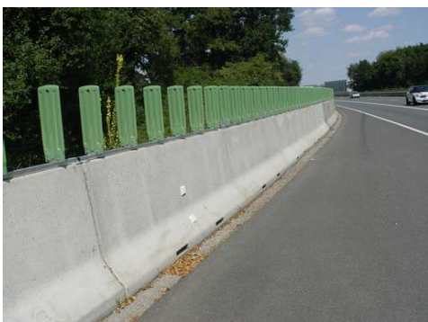
Example of an installation on concrete walls