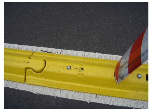
Rubber studs ensure secure adhesion for temporary use (left) For permanent use, the barriers can be screwed to the ground (right)