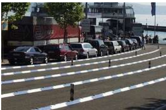
Optional colour example: blue – white (more colours are available at request)